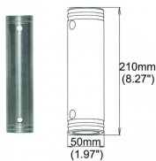
Spacer 210mm (8.27") female