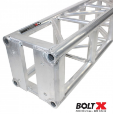
6' Ft. BoltX 12" inch Professional Box Truss Segment | 3mm Wall SKU: XT-BT1206