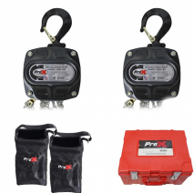
Pair 1 Ton Manual Chain Hoist with 30 Ft (9 M) Chain for Stage Truss roof system and line array speakers SKU: XT-MCH1TX2-30FT