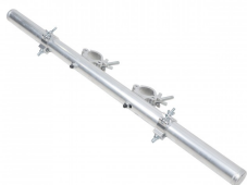
42-90 inch LED LCD Plasma TV Monitor Screen Display Mount for F34 F33 F32 F31 Bolted 12 inch Truss Segments SKU: XT-PLASMA MK2