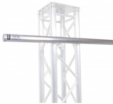
40 inch Truss Mounting Pole Extension Pole for Mounting Stage Lighting and more SKU: XT-DC40