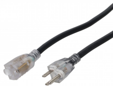
50' Ft 110VAC Female 18AMP Power Cord 14AWG Extension Cable Power Cord SKU: XC-P141-50