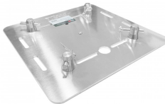
16" Aluminum 6mm Truss Base Plate for F34 F32 F31 Conical Square Truss with Connectors SKU: XT-BP16A