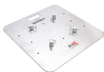
24" x 24" 8mm Aluminum Base Plate F34 Trussing Includes Conical Connectors SKU: XT-BP2424A