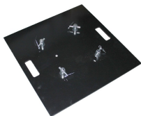
24" Steel 8mm Truss Base Plate for F34 F32 F31 Conical Square Truss with Connectors Black Finish SKU: XT-BP2424S