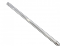
3.28 Foot - 1M F31 Single Tube Truss Segment | 2mm Wall SKU: XT-S328