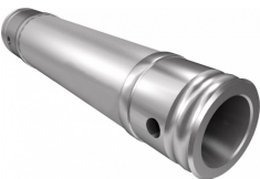
1.64 Foot - .5M F31 Single Tube Truss Segment | 2mm Wall SKU: XT-S164