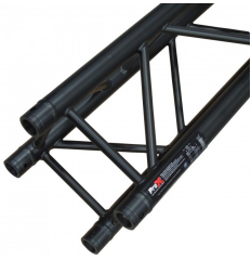
8.20ft (2.50m) F34 Segment Black Powder Coated | 2mm Wall SKU: XT-SQ820BLK