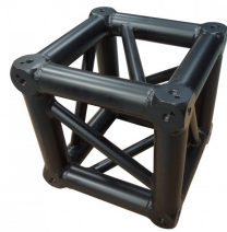
6 Way Square Truss Junction Block - Includes 4 Way 16 Half Conical Couplers | Black Powder Coated | 3mm Wall SKU: XT-JB6W-4W-BLK