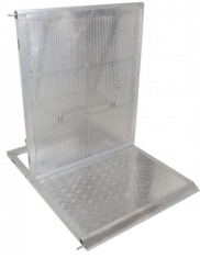
4FT Heavy-duty Aluminum Ventilated Crowd Barrier Barricade and Base SKU: XT-CSB4FT