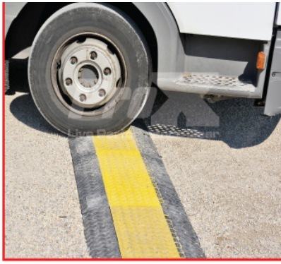
Withstands up to 60 Tons