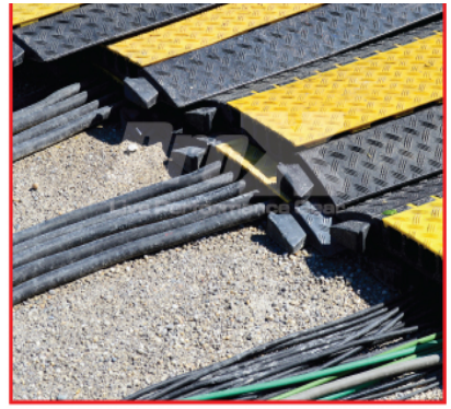
Available in 2ch / 4ch / 5ch