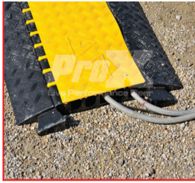
Fits cables up to 2-inches thick