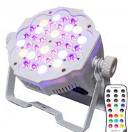
Fusion RGBWA Par 36x 1W LED Slim Par White Housing SKU: X-PAR36RGBWA1WWIRC