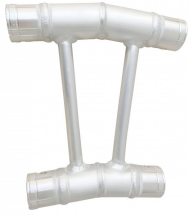
7 Degree F32 Truss Corner SKU: XT-F32-7D