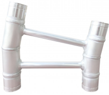
12 Degree F32 Truss Corner SKU: XT-F32-12D