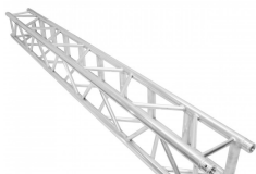
9.84 FT 3M F34 Professional Ladder Truss Segment 3mm Tubing SKU: XT-SQPL984