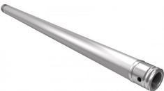
4.92 Foot - 1.5M F31 Single Tube Truss Segment | 2mm Wall SKU: XT-S492