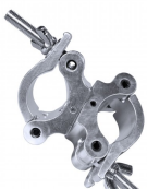
Aluminum Pro O-Style M10 Dual Clamp with Big Wing Knob for 2" Truss Tube Capacity 1102 lbs. SKU: T-C6