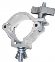
Aluminum Slim M10 O-Clamp with Big Wing Knob for 2" Truss Tube Capacity 165 lbs. SKU: T-C9H