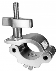
Aluminum Pro M10 O-Clamp with Big Wing for 2" Truss Tube Capacity 1102 lbs. SKU: T-C4H