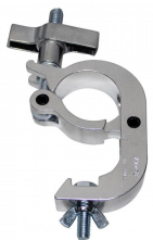
Aluminum Pro Slim Hook Style M10 Clamp with Big Wing Knob for 2" Truss Tube Capacity 330 Lbs. SKU: T-C5H