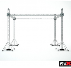
Stage Flat Roofing System Package With 4 Chain Hoists | 30 Ft W x 20 Ft L x 23 Ft H SKU: XTP-GS302023