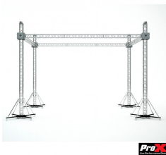
Stage Roofing System 30'W x 30'L x 23'H - Incl 4 Chain Hoist SKU: XTP-GS303023