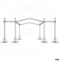
12D Stage Roofing System with 7 Ft Speaker Wings and 6 Chain Hoists | 30 Ft W x 30 Ft L x 23 Ft H SKU: XTP-GS303023-PR2-12D