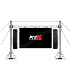
LED Screen Display Panel Video Fly Wall Truss Ground Support System 30'W x 23'H with Hoist SKU: XTP-GS3023