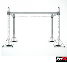
Stage Flat Roofing System Package With 4 Chain Hoists | 30 Ft W x 20 Ft L x 23 Ft H SKU: XTP-GS302023