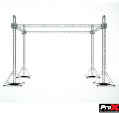
Stage Roofing System 30'W x 30'L x 23'H - Incl 4 Chain Hoist SKU: XTP-GS303023