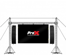
LED Screen Display Panel Video Fly Wall Truss Ground Support System 30'W x 23'H with Hoist SKU: XTP-GS3023