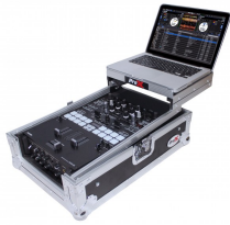
Flight Case for Pioneer DJM-S9 & DJM-S7 Mixer with Sliding Laptop Shelf SKU: XS-DJMS9LT