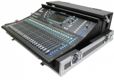
ATA Digital Audio Mixer Flight Case for Allen & Heath SQ5 Console with Doghouse compartment and Caster wheels SKU: XS-AHSQ5DHW