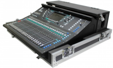
ATA Digital Audio Mixer Flight Case for Allen & Heath SQ6 Console with Doghouse compartment and Caster wheels SKU: XS-AHSQ6DHW