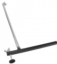
Single 3 Ft. Outrigger Support Brace for Leveling Ground Support Truss Tower Base SKU: XT-GSOUTS3