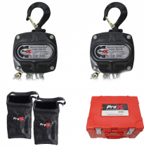
Pair 1 Ton Manual Chain Hoist with 30 Ft (9 M) Chain for Stage Truss roof system and line array speakers SKU: XT-MCH1TX2-30FT