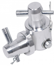
Conical Tube Ground Support Post towers Male to Male Hinge Joint Fits F31 F32 F34 SKU: XT-HINGE