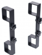
Heavy Duty 2 Leg Clamp for StageQ Staging SKU: XSQ-MX2MK2