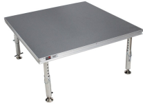
StageQ 4' x 4' Single Stage Unit Height Adjustable from 28 to 48" in. SKU: XSQ-4X4MK2