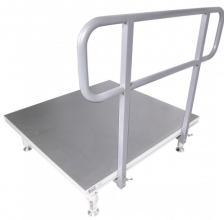
4 ft Guardrail for StageQ and MK2 Stages SKU: XSQ-GR4FTPRO