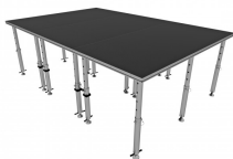
12FT x 8FT StageQ 3-Stage Platform Platforms 4FT x 8FT Package Height Adjustable 28-48 inch SKU: XSQ-12X8PKG48