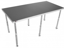
StageQMK3 4 x 8 FT Single Portable Stage Unit Height (6) Adjustable Legs from 28 to 48 in. SKU: XSQ-4X8MK3