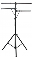
Height Adjustable DJ Lighting Stand with (2) Side Bars – adjusts up to 12 Ft Height SKU: T-LS01M