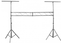
Set of (2) 10 Ft. DJ Stage Lighting Truss Stands System Includes (2) T-Adapters and (2) I-Beam Segments SKU: T-LS31M