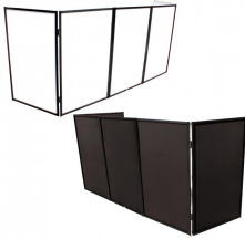
5 Panel Black Frame DJ Facade W-Stainless Quick Release 180 Deg. Hinges SKU: XF-5X3048B