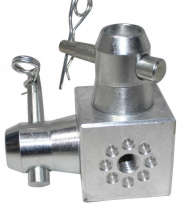
XT-SJB-2W Single Junction Box Includes 2 Sided Connecting Hardware for F34 F33 F32 F31 Truss SKU: XT-SJB-2W